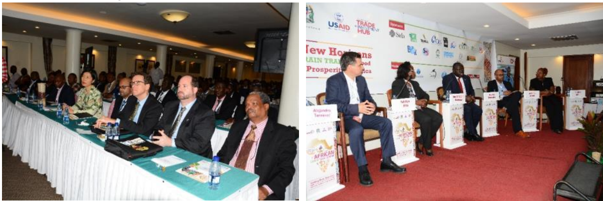
The various Panels of Experts and distinguished dignitaries at the Summit