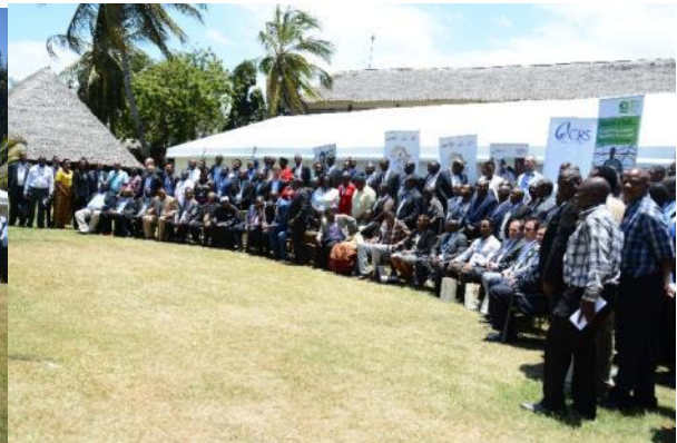
Delegates at the 7 th African Grain Trade Summit that was held from 5 th to 7 th October 2017 in Dar es Salaam, Tanzania