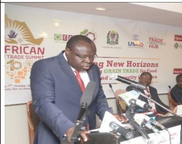
Hon. Christophe Bazivamo, Deputy Secretary General - Productive and Social Sectors at the East African Community